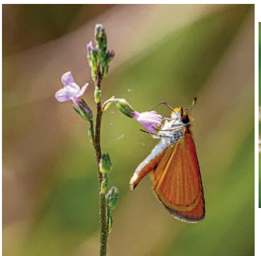
Least Skipper ( Ancyloxypha numitor ), 6/6/22, Shrewsbury, MA, Bruce deGraaf