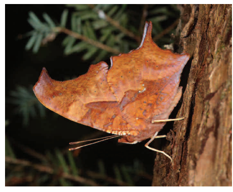
Question Mark ( Polygonia interrogationis), 8/7/22, Groton, MA