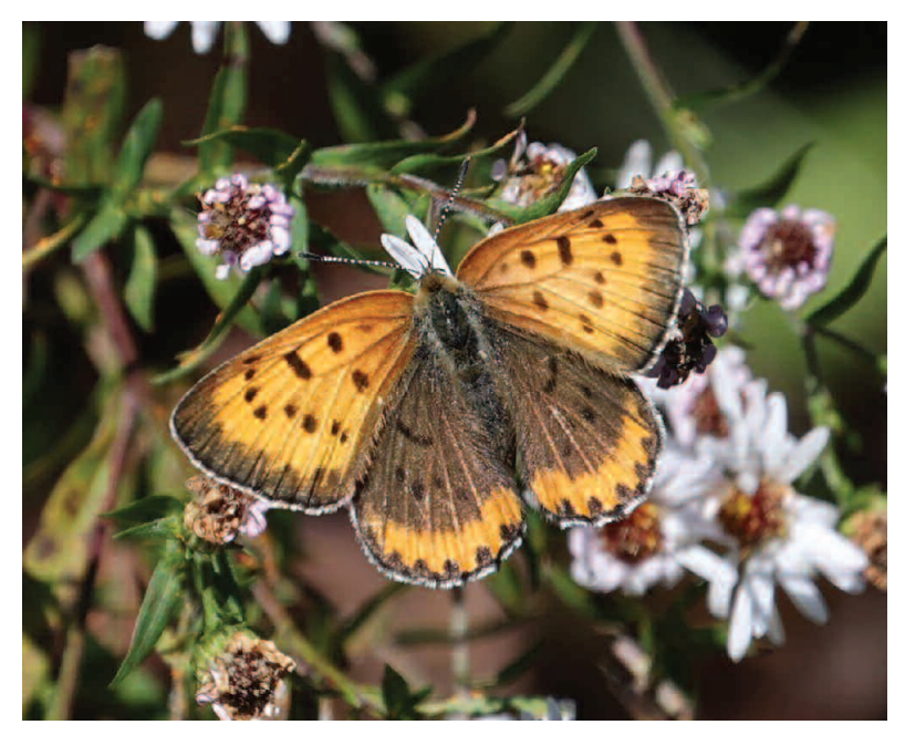
Bronze Copper female ( Lycaena hyllus ), 10/8/22, Brookfield, MA, Alan Rawle