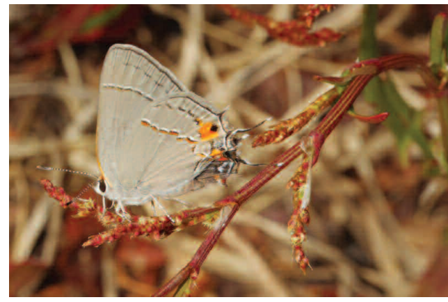
Gray Hairstreak (Strymon melinus), 5/13/22, Bo Zaremba