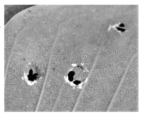
See if you can spot the newly-hatched Monarch caterpillar!