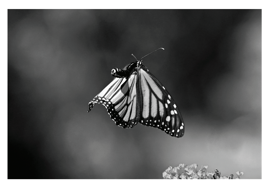
Monarch (Danaus plexippus), 9/21/22, Amherst, MA

https://savethetaunton.org/donations/donate/ and mark "Education Center" in the comments area.