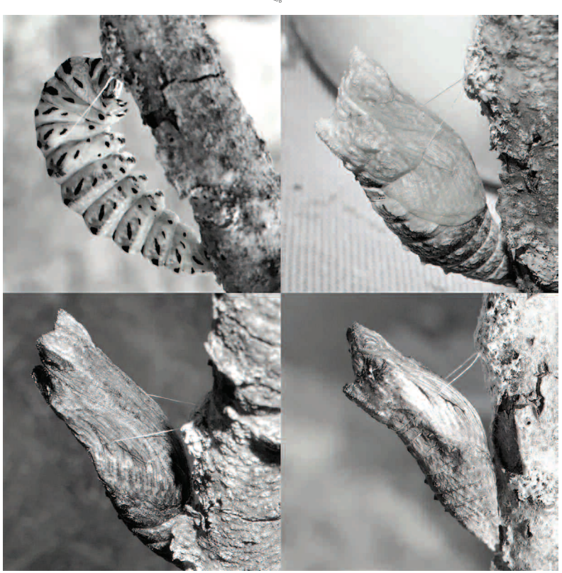
Black Swallowtail Chrysalis on stick, Linda Graetz