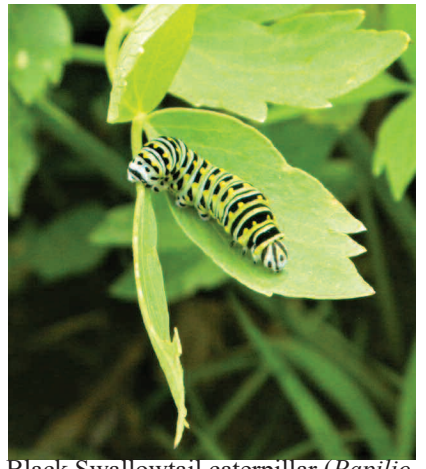
Black Swallowtail caterpillar ( Papilio polyxenes ) on Lovage, 6/12/22, West Bridgewater, Don Adams

Zabulon Skipper male ( Poanes zabulon ), 8/15/22, Hadley, MA, Bernie Rubenstein