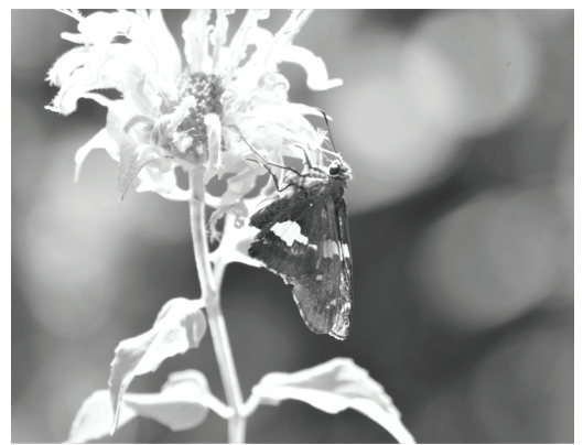
Silver-spotted Skipper ( Epargyreus clarus ), 8/19/22, Amherst, MA, Bernie Rubenstein

Abbreviations: AP-Allen's Pond; BFD-Barre Falls Dam; BMB-Broad Meadow Brook, CA-Conservation Area; CG-Community Gardens; CRP-Charles River Peninsula; CRV-Connecticut River Valley; CST-Crane Swamp Trail; EQLT-East Quabbin Land Trust; F&G-Fish & Game; FPB-Fort Pond Brook; FS-Fannie Stebbins Wildlife Sanctuary; GBH-Great Blue Hill; GM-Great Meadows NWR; GITW-Garden in the Woods; HPM-Horn Pond Mountain; IBA-Important Bird Area; IRP-Ipswich River Park; IRWS-Ipswich River Wildlife Sanctuary; LA-Larz Anderson Park; LPWS-Long Pasture Wildlife Sanctuary; MAS-Mass Audubon Sanctuary; MCRT-Massachusetts Central Rail Trail; MB-WMA-Martin Burns WMA; MHF-Moose Hill Farm; ML-Mystic Lakes; MMP-Mountain Meadow Preserve; MPRA-Mill Pond Recreational Area; MSSF-Myles Standish State Forest; MV-Martha's Vineyard; NABA 4JC-North American Butterfly Association 4th of July Count; NAC-Nine Acre Corner; NCG-Northampton Community Gardens; NCM-North Common Meadows TTOR; NP-Newburyport; NRT-Norwottuck Rail Trail; NWR-National Wildlife Refuge; PL-Power Line; PRNWR-Parker River NWR; Res.-Reservoir or Reservation; RM-Rumney Marsh; S-C - Stevens-Coolidge TTOR; SF-State Forest; SP-State Park; TTOR-The Trustees of Reservations; WMA-Wildlife Management Area; WMWS-Wachusett Meadow Wildlife Sanctuary; WRR-Waskosim Rock Res.