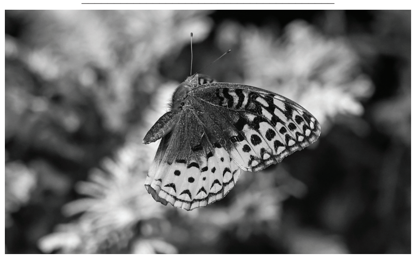
Great Spangled Fritillary ( Speyeria cybele ), 9/26/22, Amherst, MA

Cover photo: Sachem female ( Atalopedes campestris ), 8/28/22, Wareham, MA