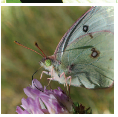
white female Sulphur ( Colias sp.), 7/3/22, Lincoln, MA, Linda Graetz