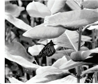
Female Monarch laying eggs on Common Milkweed

Using these materials, I raised and released many Monarchs, and somewhere I discovered a clothespin trick. I put a clothespin across the top of the chrysalis jar, put a square of panty hose on the top and secure it tightly