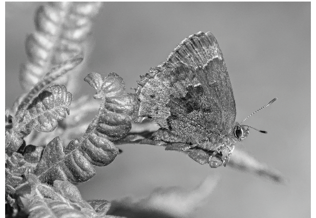
Frosted Elfin ( Callophrys irus ), 5/18/22, Shrewsbury, MA, Bruce deGraaf