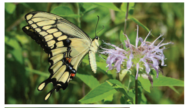
Giant Swallowtail ( Papilio cresphontes), 7/30/22, Sheffield, MA

Common Buckeye (Junonia coenia), 7/21/22, Southboro, MA, Dawn Vesey