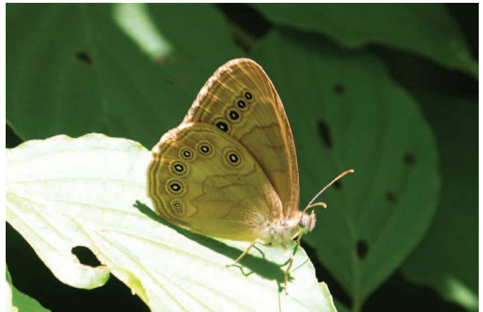
Eyed Brown (Satyrodes eurydice), 6/28/22, Washington, MA