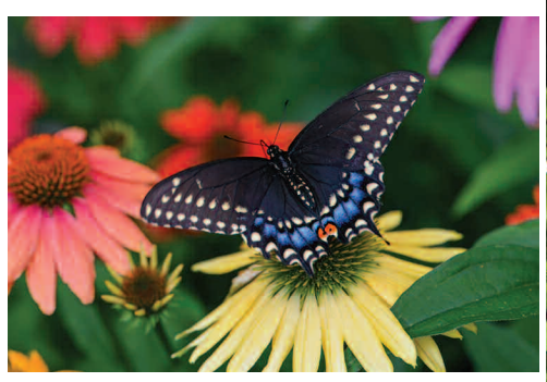
Black Swallowtail ( Papilio polyxenes ), 7/16/22, Amherst, MA