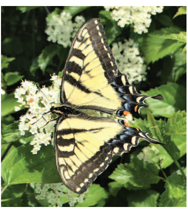
Eastern Tiger Swallowtail ( Papilio glaucus ), 6/10/22, Upton, MA, Madeline Champagne