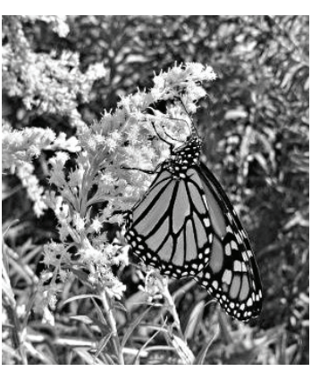
Monarch ( Danaus plexippus), 9/8/22, Richmond, MA