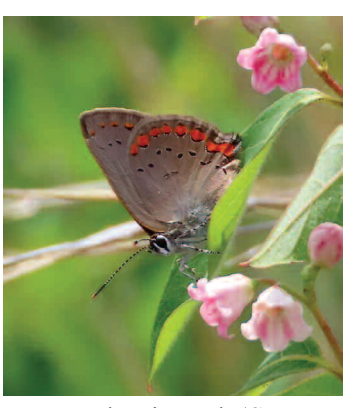
Coral Hairstreak ( Satyrium titus), 7/3/22, Woburn, MA