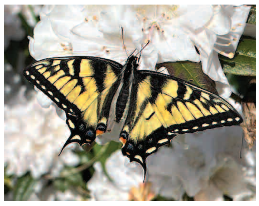
Eastern Tiger Swallowtail ( Papilio glaucus ), 5/11/22, Reading, MA, Ashley Gross